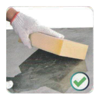
2. Clean tile surface