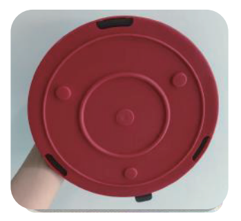
3. Save when finished