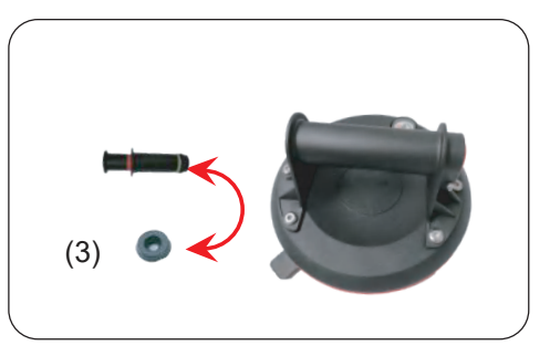
2. Loosen the bolt from the piston body, remove washer, replace the sealing ring (3). Insert the washer and secure with the screw