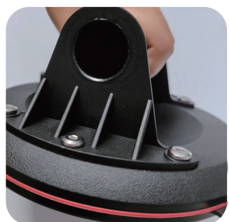
3. Clean the tank