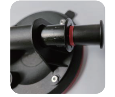
2. After cleaning the hand pressure pump, grease can be applied appropriately