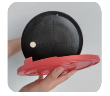
2. Cover with protective cover