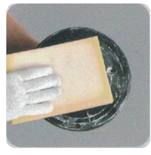
1. Clean the surface of the suction cup

Attention: Do not put it in tile glue, mud and other bad environment, so as no to damage so affect the normal use of the product.