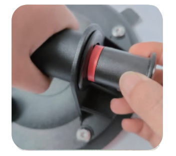
1. Pull out the hand pressure pump slowly