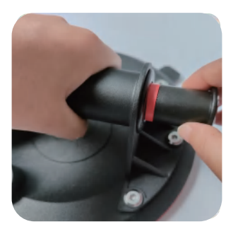
1. Pull out the hand pressure pump slowly