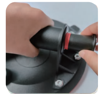
1. Pull out the hand pressure pump slowly