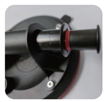
3.Finally, insert the piston pressure pump into the handle.